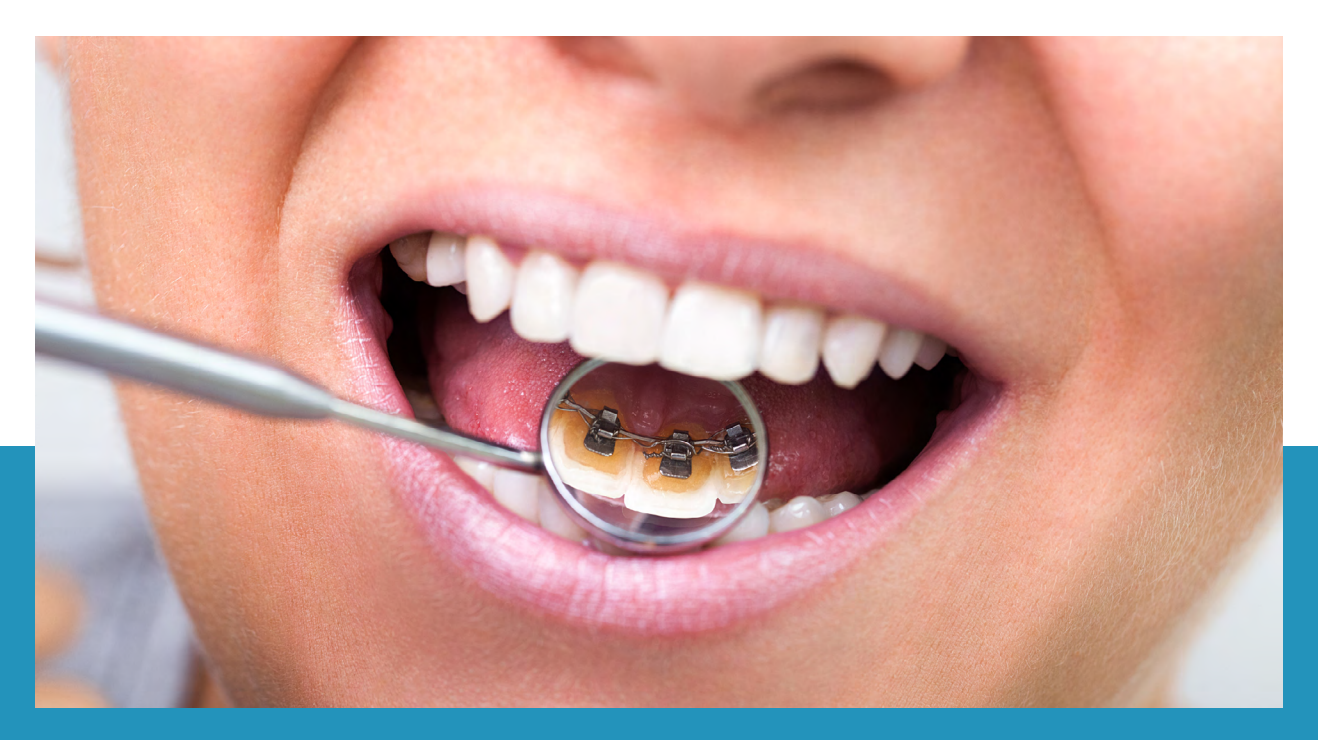
7. Do They Have A